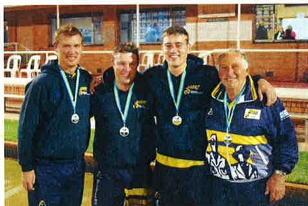
Bundoora's State 4s Champions

** State Championship runner-up in this event