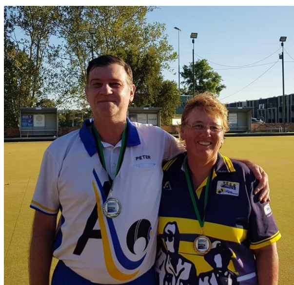
Yarra Champion of Champion singles winners