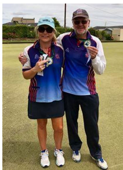
Yarra Singles winners